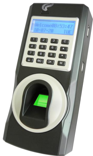
Model: A-1300 Series Manufacture: David-Link