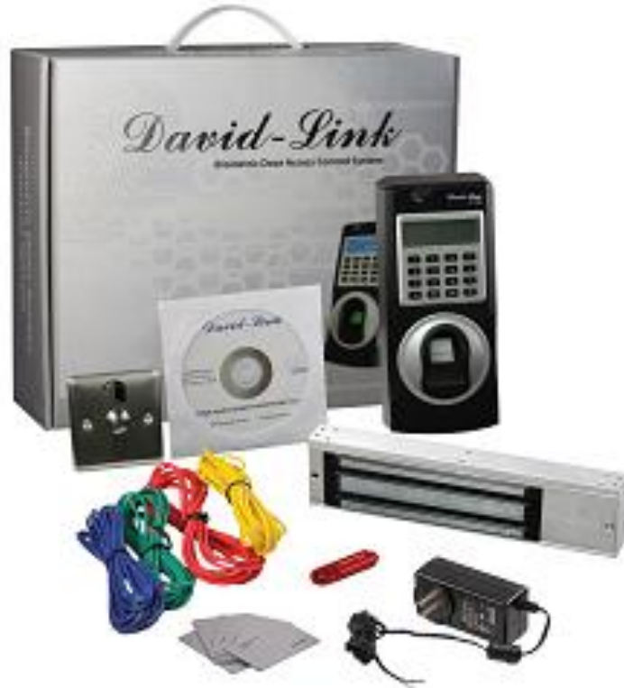
A-1300P- Access Control Starter Kit